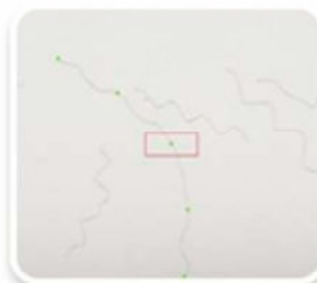
Identifying long fibres

Diamlength uses digital camera technology and image processing technology. The fibres traverse across a set of imaging plates that also form as the flute to suck up the fibres from the beaker. The fibres are illuminated by a high-powered, precise LED light source in less than 1 microsecond for each image. Sophisticated software algorithms detect and measure all the fibres in the image. Each fibre is measured multiple times along its length to reduce any variations in the diameter.