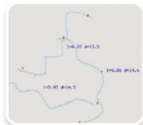
Accurate fibre following and analysis