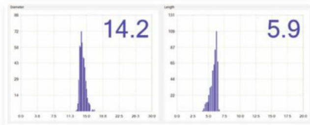
Analysis of 6 mm chopped PP fibre